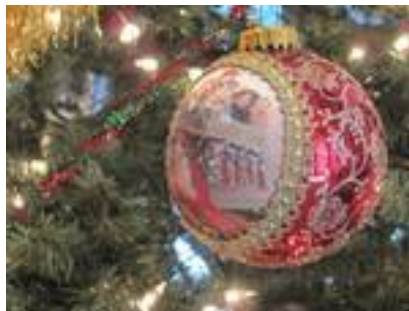
This ornament reminds us of Christmases past.