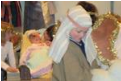
The manger scene looks Different up close!