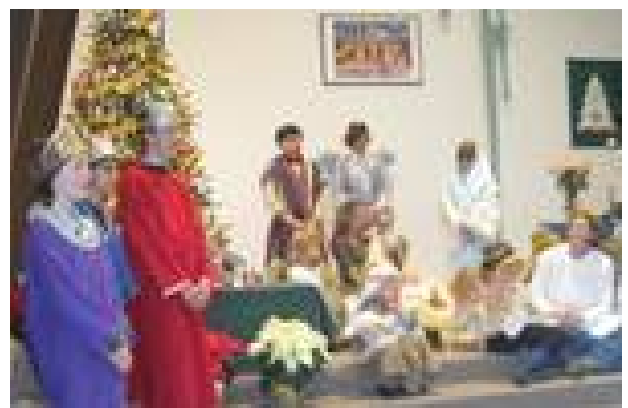
The Christmas pageant manger scene from a distance.